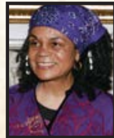
Sonia Sanchez Poet, Activist, and Scholar

FEATURED AUTHORS EVENT 10AM-12 NOON / 89TH ANNUAL LUNCHEON: 12:30PM